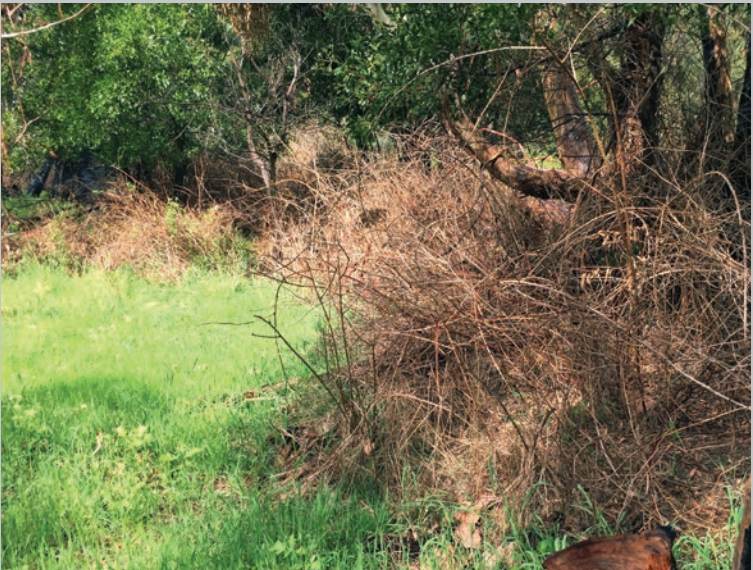
Strath Creek Blackberry Action Group Landowner participation - reducing blackberry on the ground