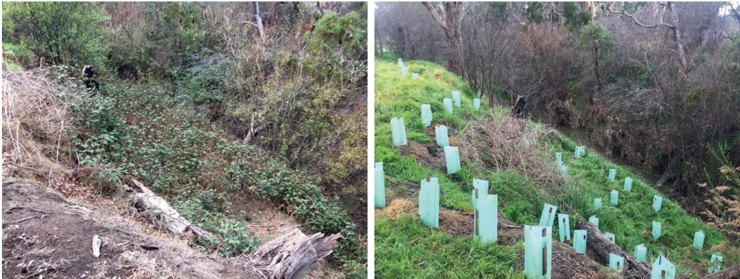
Whittlesea and Surrounds Blackberry Action Group Landholder action – Eden Park’s community engagement project delivering a better environment