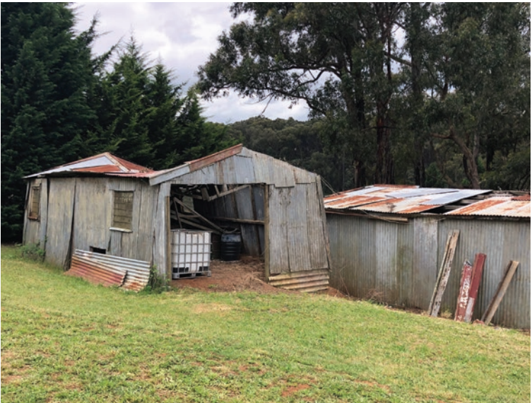
Silvan Blackberry Action Group - before/after images