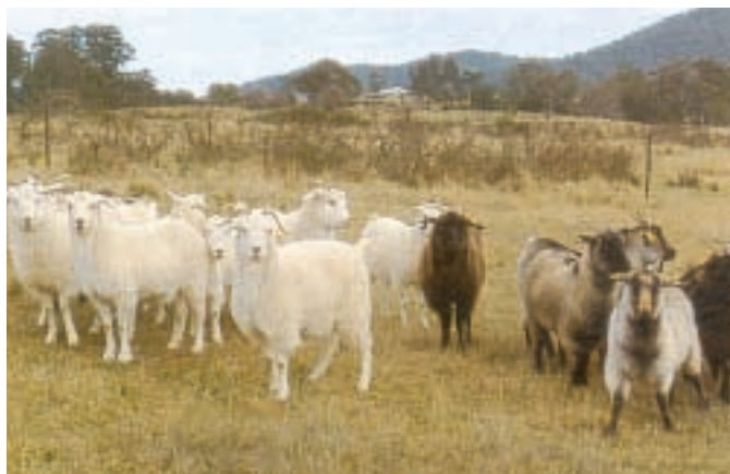
Goats graze broom (rear) at all stages of its growth.