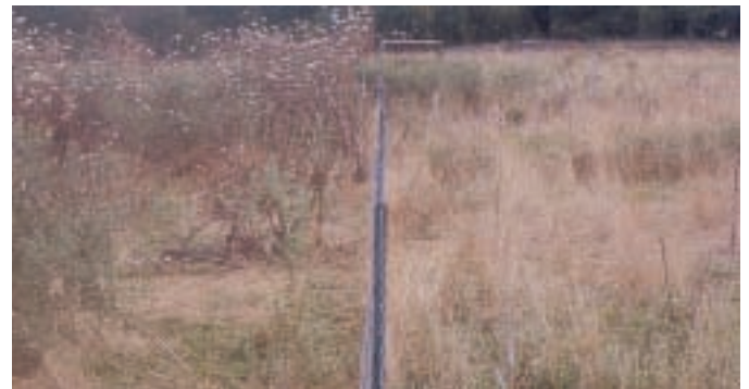
Variegated thistle control: goats were grazed in the right paddock.