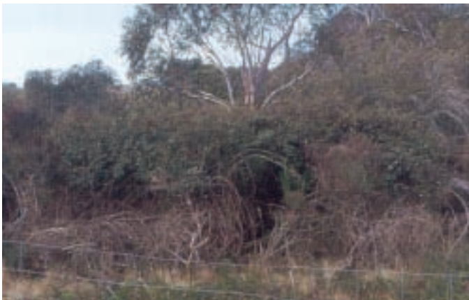
Fence in dense infestations. By confining the goats it ensures increased grazing pressure on the weed.

For localised woody weed infestations it may be best to isolate the infestation with fencing. This has two benefits: it confines your goats to the infested area, so that fewer goats may be required for the job of controlling the weed; and it preserves the remaining pasture for your sheep or cattle.