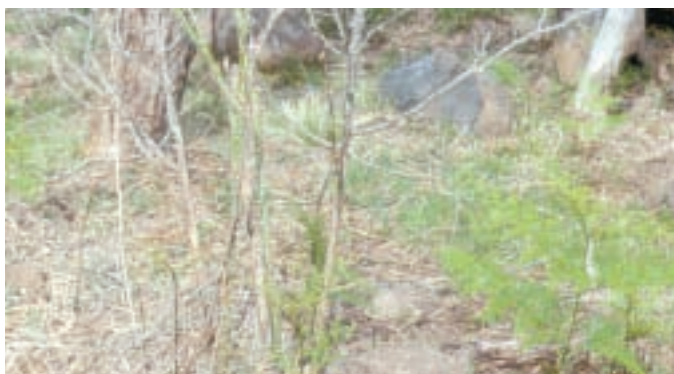
A goat enjoyed this briar.

For large areas of weed cover (more than 1.5 ha of dense weed) it is best to combine heavy goat grazing with integrated control methods.