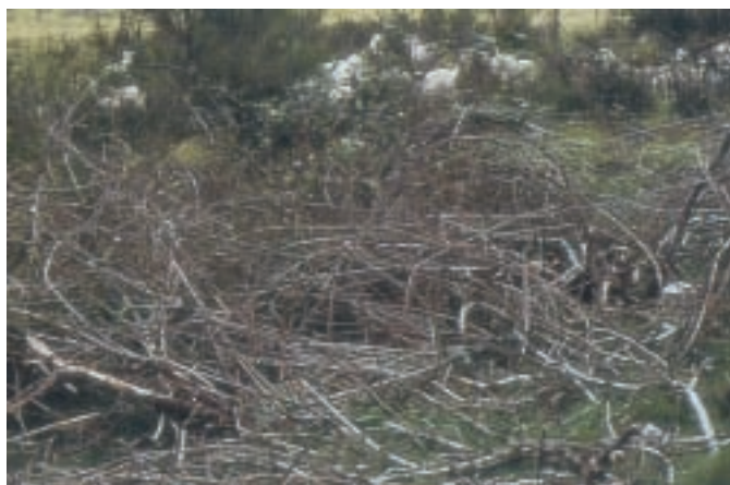
This is all that remains of scotch broom after goats graze it.

Dense growth of scotch broom is greatly reduced within two years if goat grazing at a level that completely defoliates the weed. Control can be achieved within another two years, provided all seedlings are eaten.