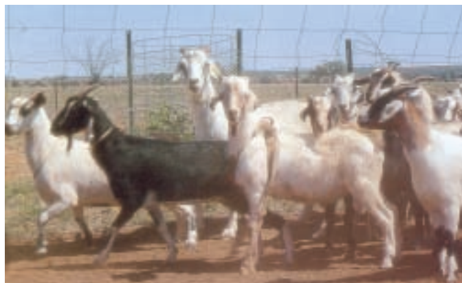
Feral low grade cashmere or meat-type goats (above) are recommended for weed control.

The Australian goat industry consists of meat, fibre and dairy sectors, all of which can be employed for weed control at various stages of the production cycle. Specialist meat-producing goats, Boer goats, rangeland goats and their crosses are most commonly used for weed control. Fibre-producing Cashmere and Angora goats are also well suited to weed control, although care should be taken to avoid fibre entanglement and contamination. These are generally only used off-shears and when the risk of cold stress is at a minimum. Dairy goats also play a role in weed control at some stages in the production cycle, but this is less common due to the intensive nature of the dairy industry.