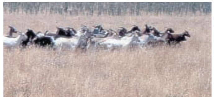
...But goats make a meal of it