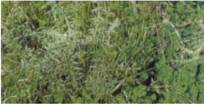
Nodding thistle in clover. The thistle will be palatable to goats once it flowers.

eaten, but the pasture is overgrazed, the number of goats may be reduced. If all the seed heads are being eaten but the pasture is not sufficiently grazed, increase the number of sheep or cattle.