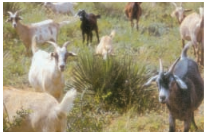
Less productive land may be reclaimed by goat grazing.

The integration of goats on a farm can have ecological and economic advantages provided sound management practices are adopted. This introduction should be supplemented by more detailed information available through the Going into goats: Profitable producers' best practice guide , breed societies and state departments of primary industries. The best advice you are likely to receive regarding goat production is, however, likely to come from goat producers in your local area.