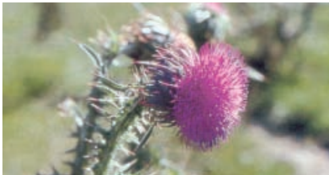
Goats eat nodding thistle at this stage of its growth.