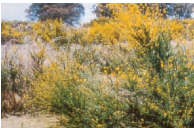
Scotch broom before grazing.