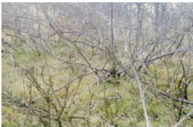
Scotch broom after grazing.