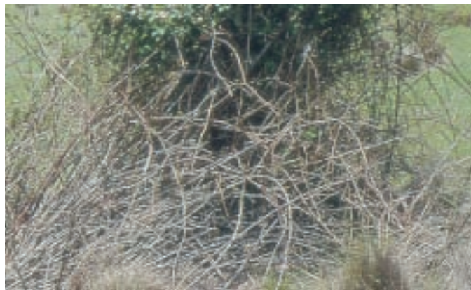
Blackberry controlled by grazing goats.

along fence lines. Goats will also eat any weeds that germinated too early or too late to be affected by herbicides. Similarly, degraded non-arable country with woody and other weeds may be reclaimed by goat grazing.