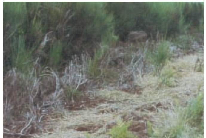
Slash tracks through thick infestations (in this case, scotch broom) to allow goat access.

In dense infestations of woody weeds such as blackberry, scotch broom or gorse, slash paths through the infestation to allow greater access for the goats.