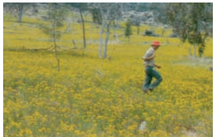
A severe infestation of St John's wort at Wyangala.

Many grazing management strategies have been tried in an effort to control the weed. The best strategy used so far in the most difficult situation, large paddocks in hill country, has been the combination of non-fibre producing goats and Santa Gertrudis cattle.