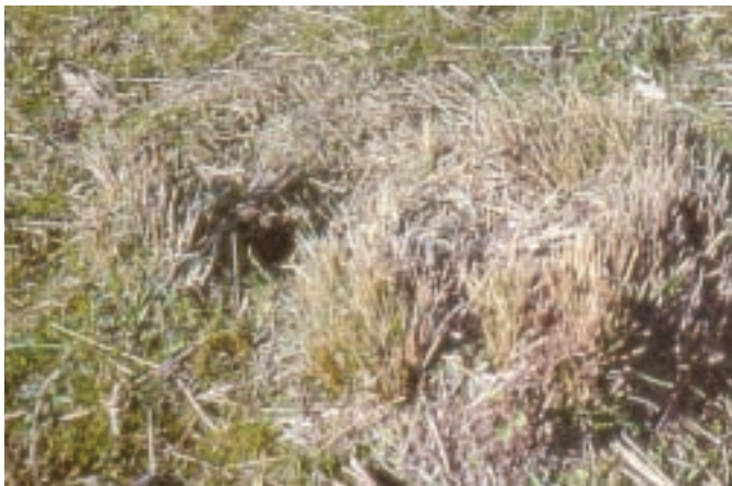
Grazing of poa tussock prevents shading of surrounding pasture, allowing it to spread.

Remember to assess seed head removal and pasture availability, and adjust stock numbers accordingly.