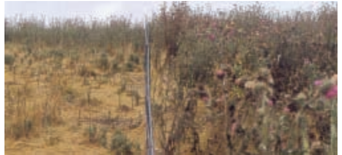
No nodding thistle: goats grazed the left paddock.