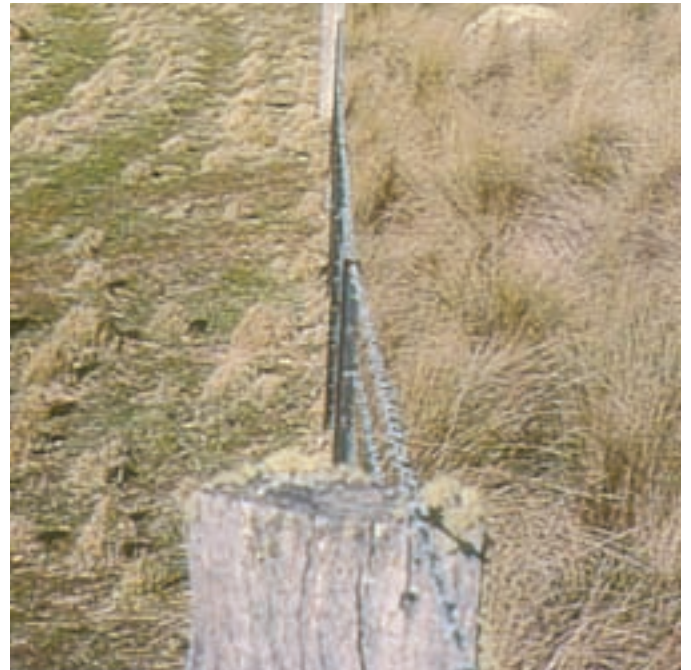
Goat control of poa tussock, left of the fenceline.

After the autumn break, seed and fertilise and stock with goats at 15/ha. Spot spray fencelines.